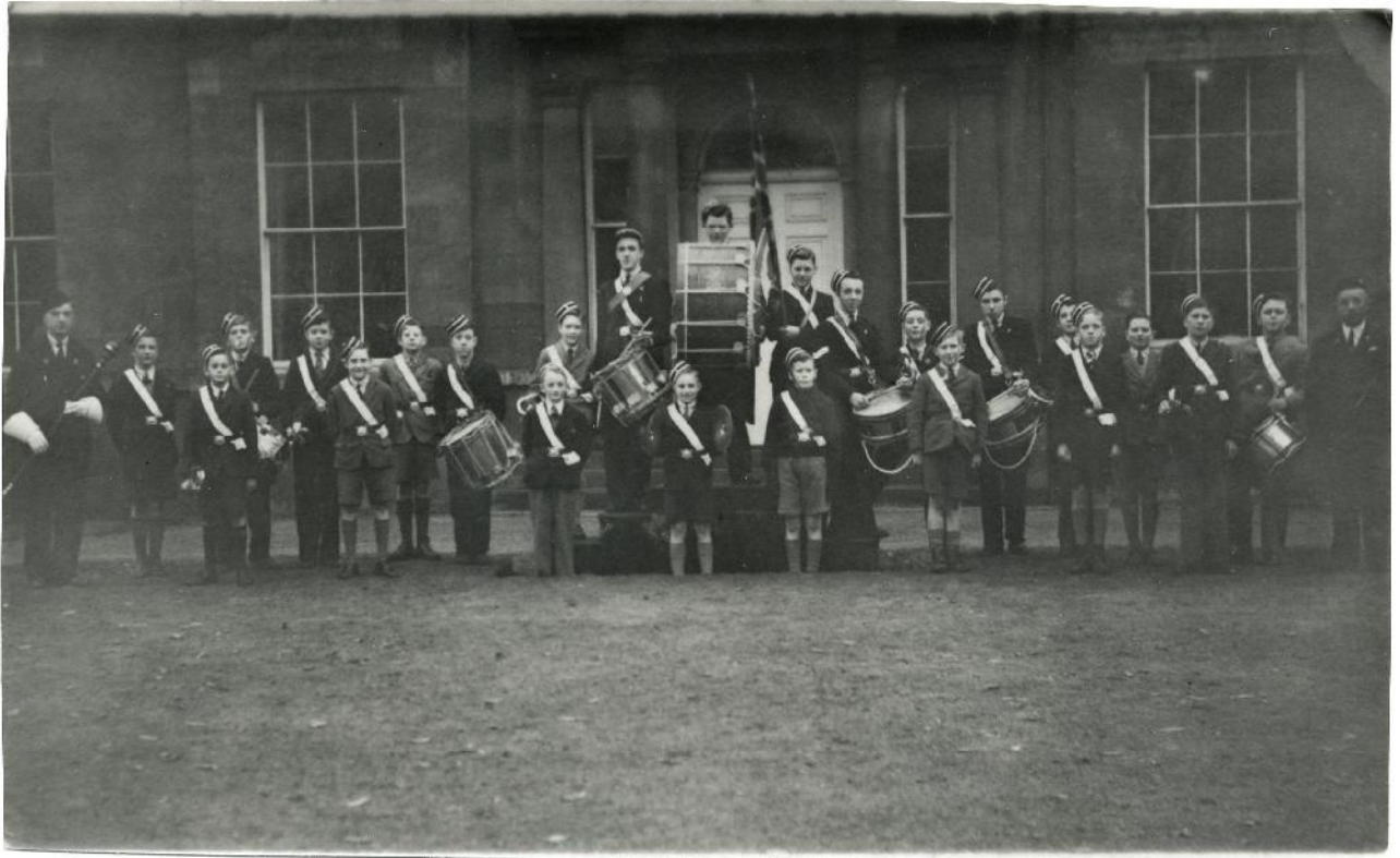
Church Boys' Brigade at Bowcliffe Hill in 1942. See book page 66.