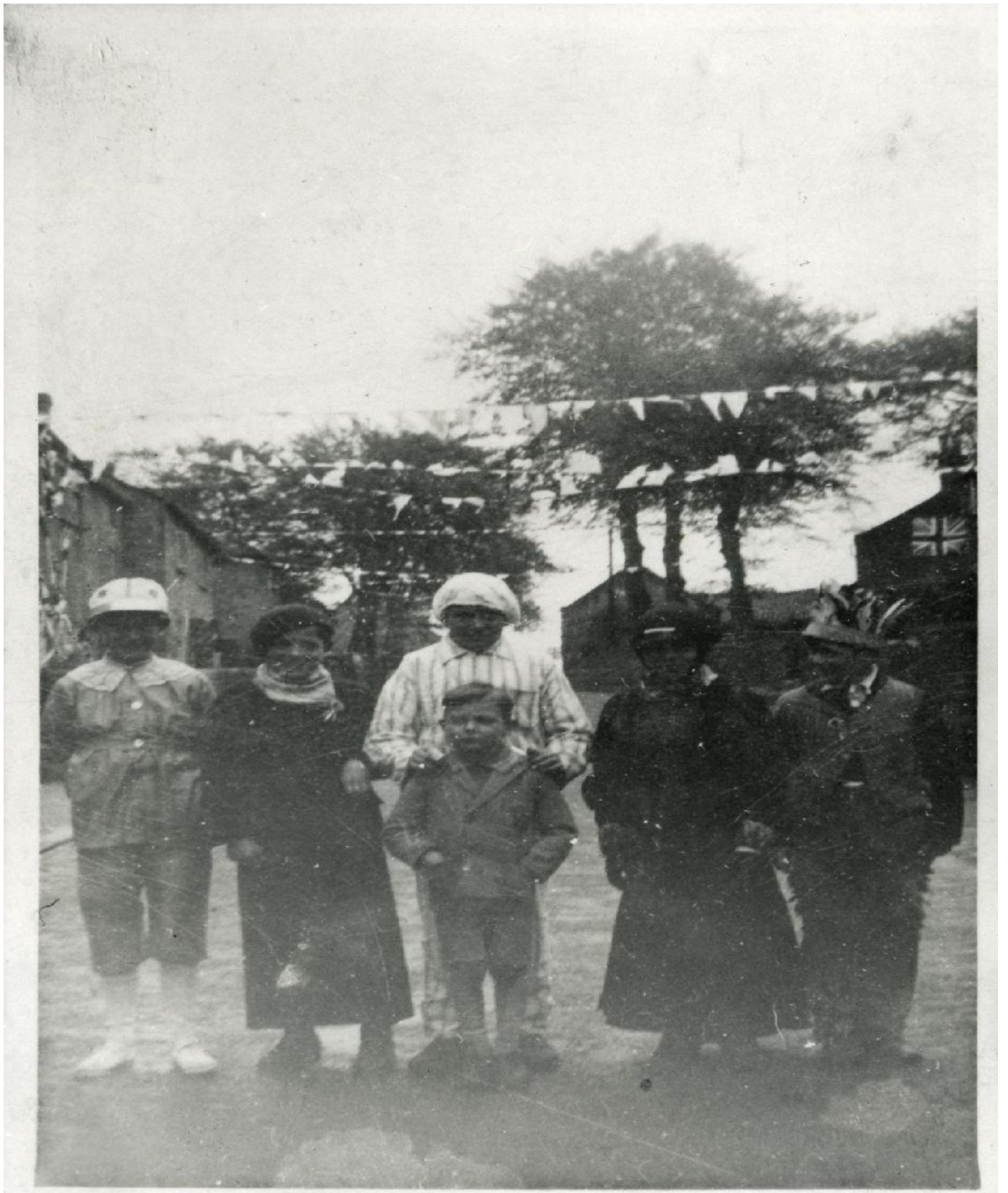
Coronation Celebrations 1937. See book page 63.