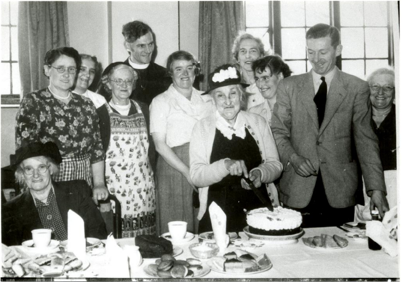
Christmas Party in the 1950's. For names see book page 51.