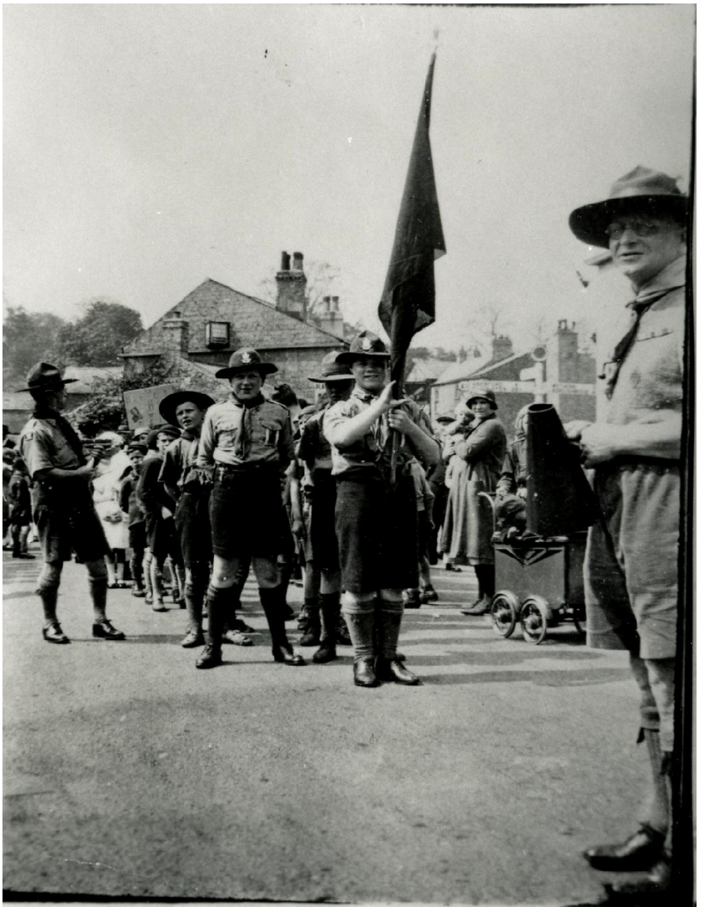
Scouts' Parade , mid -1930's . See book page 64 .