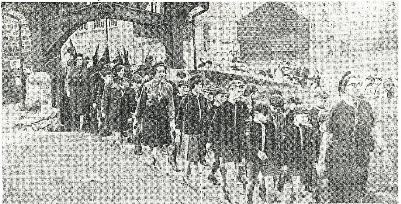
Cubs in the parade of the Tadcaster-Wetherby Local Association of Scouts, Guides, Cubs and Brownies, held at Bramham Parish Church on Sunday to commemorate St. George's Day.