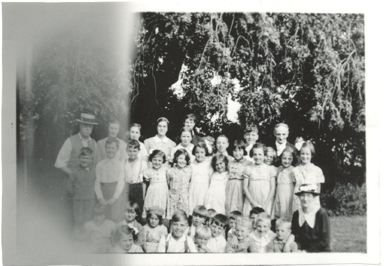
Methodist Sunday School outing to Hadley Hall before the Second World War. See book page 66.